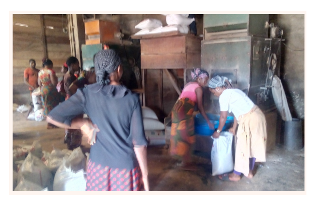
Fig-4: Women bagging processed rice in a small scale mill

The processing end of the value chain reveals a wider gulf in gender representation. Most rice mills are owned, run and managed by men. In a stark manifestation of the gender dynamics, a woman factory worker exclaimed: "They don't pay us salary! They only pay the men, the manager." As compensation, there are instances where women employees are remunerated not in cash but in "broken rice" - waste leftovers from the processing of rice.