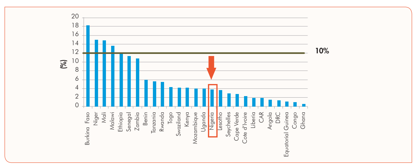
Fig 1: Maputo Declaration & Africa

Average percentage of agriculture spending in total public expenditure 2000-2010