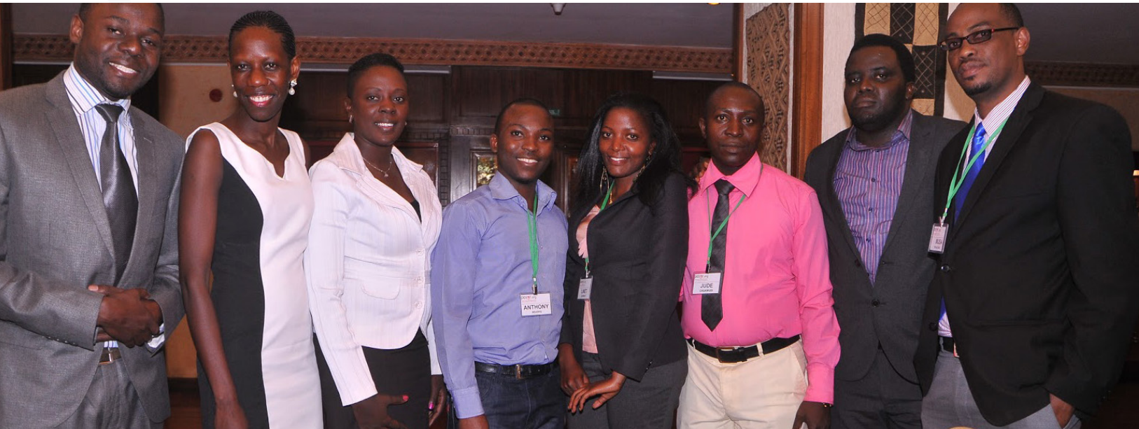
MRPP student representatives from Kenya, Uganda, Tanzania and Nigeria attended the August MRPP Week.

learning outcomes as well as student retention.