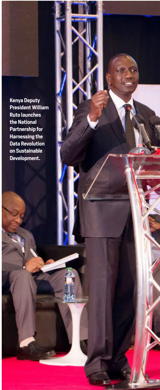
Kenya Deputy President William Ruto launches the National Partnership for Harnessing the Data Revolution on Sustainable Development.

willingness to be at the forefront, it would have been much harder to get anything done.” Many other countries are now looking to Kenya, asking how it managed to convene a national forum and how it was progressing. The forum did not just trigger conversations at the local level but also at a global level on how to turn nebulous concepts, like data revolution into concrete initiatives.