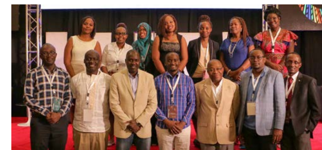
The multi-stakeholder Secretariat that put the National Data Forum together.