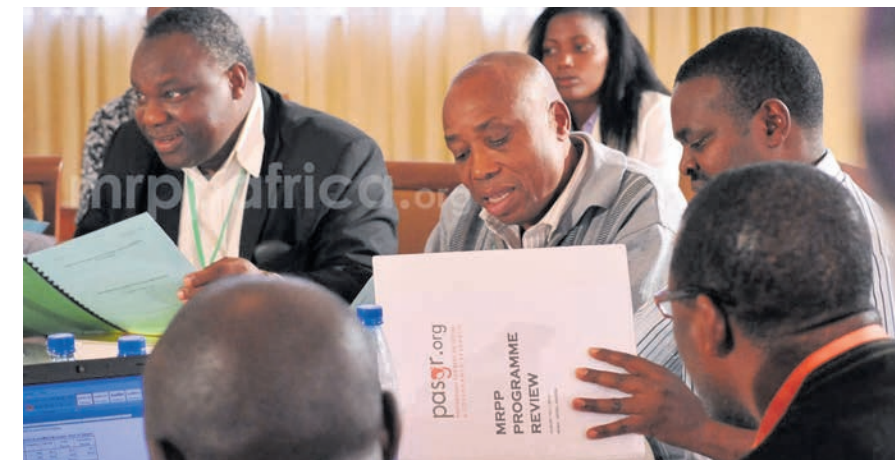
MRPP teaching staff and student representatives at the 2015 programme review workshop.

knowledge, skills and experience in content and pedagogy to MRPP teaching staff. They also provided platforms for diffusing MRPP teaching and learning strategies to staff from other social science departments who teach on the multidisciplinary programme, thus shifting boundaries of traditional discipline.