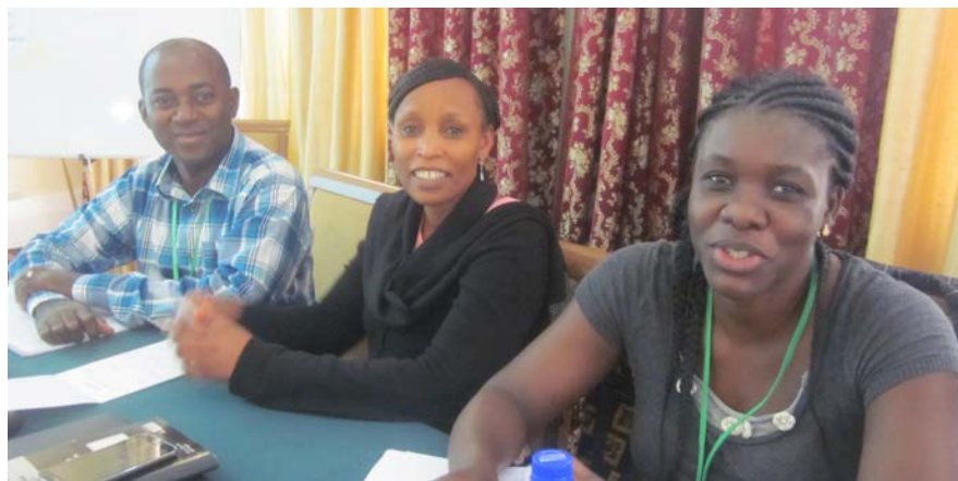
Participants take a break during one of the professional development courses held in 2015.

PASGR is now eligible to receive tax-deductible contributions from American foundations.